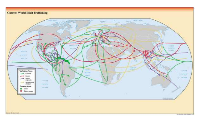
Figure 3 Current World Illicit Trafficking [26]

It should be noted that many of these converge on known pirate areas such as Nigeria and the Strait of Malacca. At the same time – and even more significantly – is the number of these routes that are explicitly maritime, specifically linking global supply to demand in European and North American markets.